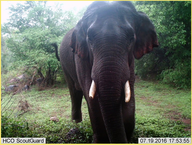
(From left to right, above to below). Fig. 3. (A) The flash of the camera trap possibly reminds Tintin of the flashlights that farmers use to chase him away from their crop fields; (B) he beats a hasty retreat, only to realize that the flash is not followed by people chasing him; (C) he then turns around to engage with the camera. Fig. 4. (D) Tintin seems unsure and shifts his weight from one leg to the other; (E) after a while, he displays his irritation by biting his trunk; (F) he finally walks past the camera without interacting with it any further.