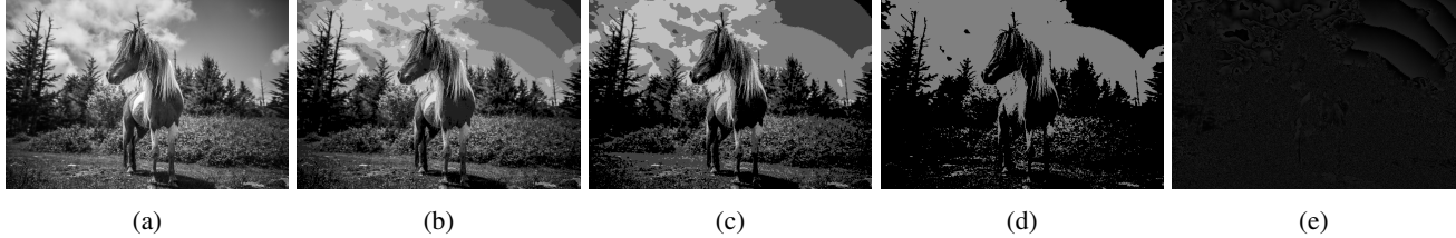
Figure 1: (a) Original 8-bit image (b) Weighted sum of (higher) bit planes 7, 6 and 5 (c) Weighted sum of (higher) bit planes 7 and 6 (d) Bit plane 7 - Most significant bit plane (e) Weighted sum of (lower) bit planes 4, 3, 2, 1 and 0.

restrict x' to be in the \ell_\infty -ball of radius \varepsilon around x . The set of Adversarial Samples can be formally defined as follows: