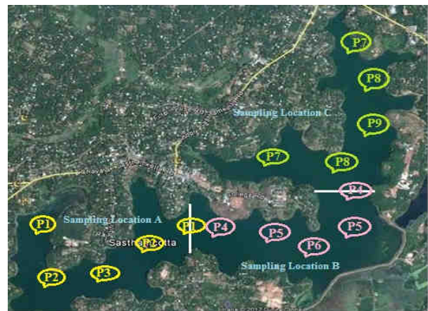
Fig 3: Sampling Points: Depth

The water quality parameters were selected on the basis of pollutants discharge and its effect on Lake Ecosystem and on human health. This is carried out by judgement of professional experts, agencies and government institutions that is determined in the legislative area. The selection of the variables from the 5 classes namely oxygen level, eutrophication, health aspects, physical characteristics and dissolved substances, which have the considerable impact on water quality, are recommended [22]. In this study Parameters were selected based on the site specific actions and experts advice and are given in table 2.